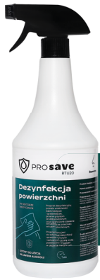
Trigger Spray 1000 ml