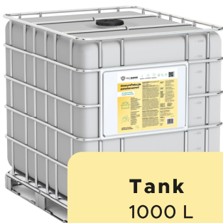
Tank 1000 L