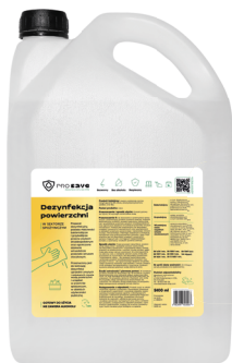
Cap Canister 5000 ml