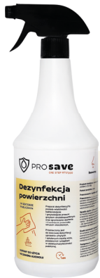
Trigger Spray 1000 ml