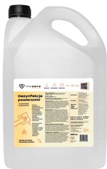
Cap Canister 5000 ml