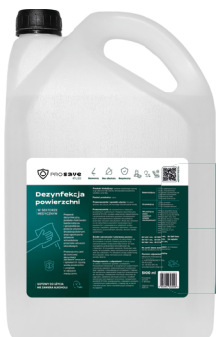
Cap Canister 5000 ml